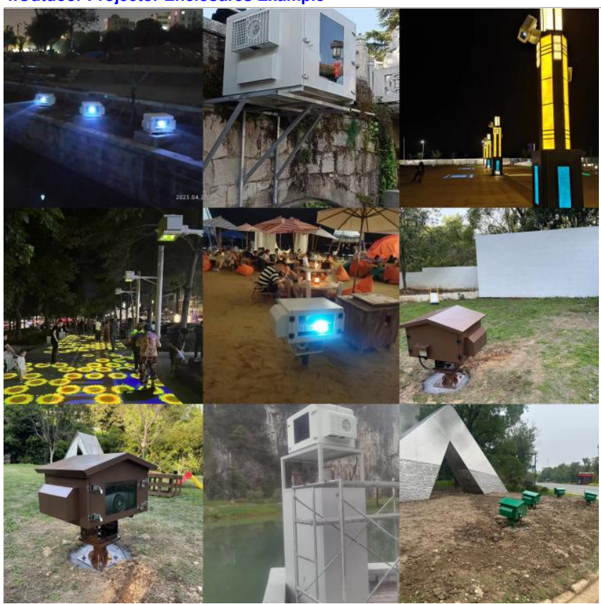
5. Embedded parts ground cage application scenario