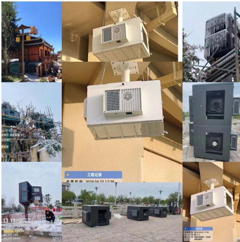
Waterproof test of projector shell: