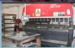
Large six-axis bending machine