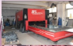
Large laser cutting machine