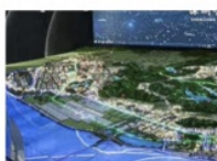
Real estate center