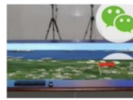
National defense application