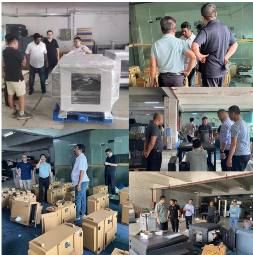
10. Lead time