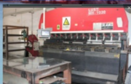
Large six-axis bending machine