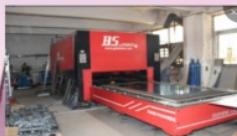
Large laser cutting machine