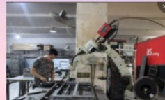
Mechanical arm welding