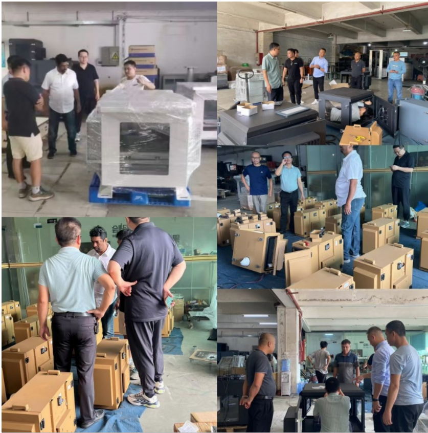
9. Waterproof test of projector shell