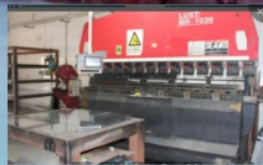
Large six-axis bending machine