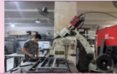
Mechanical arm welding