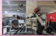
Mechanical arm welding