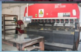
Large six-axis bending machine