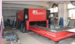
Large laser cutting machine